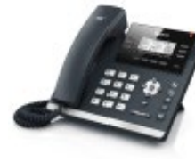
Yealink T4 series