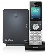
Yealink DECT Cordless